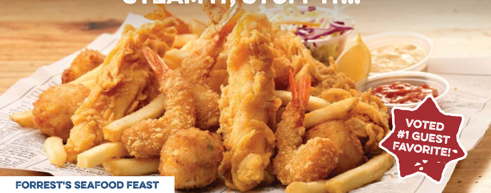
FORREST'S SEAFOOD FEAST

"SHRIMP IS THE FRUIT OF THE SEA. YOU CAN BBQ IT, BROIL IT, BAKE IT, STEAM IT, STUFF IT..."