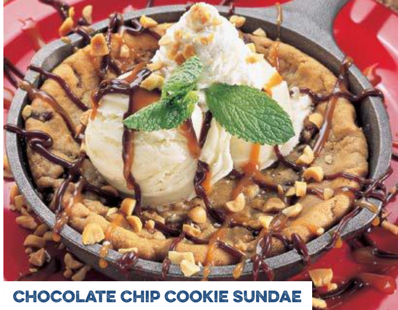
CHOCOLATE CHIP COOKIE SUNDAE