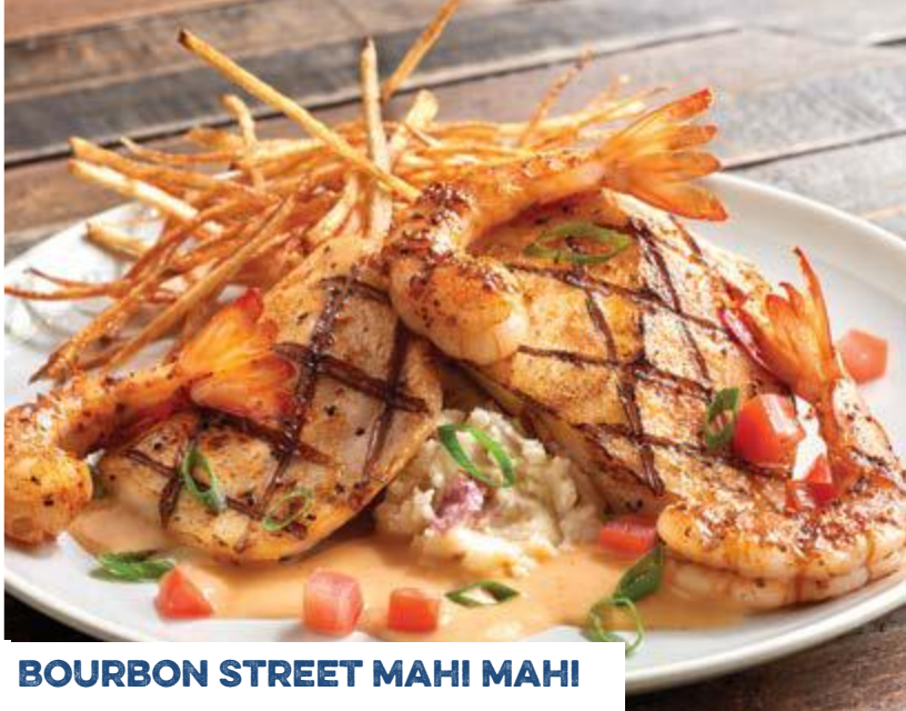
BOURBON STREET MAHI MAHI