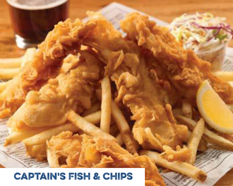
CAPTAIN'S FISH & CHIPS